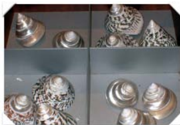
Polished shells for sale at KAAC's multi-species hatchery.