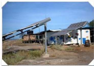
View of solar panel power supply to the hatchery.