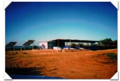
View of hatchery on completion. Note: the solar panel on the left provides power supply to the hatchery.