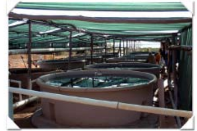
Inside view of the OAP hatchery showing production tanks.