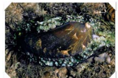
Tropical abalone: another commercial species for OAP.