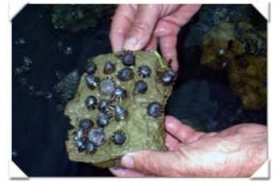
Juveniles growing on rubble in the tank.