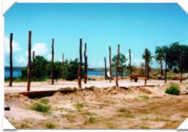
OAP hatchery at the beginning of construction Note the use of bush hardwood for construction.