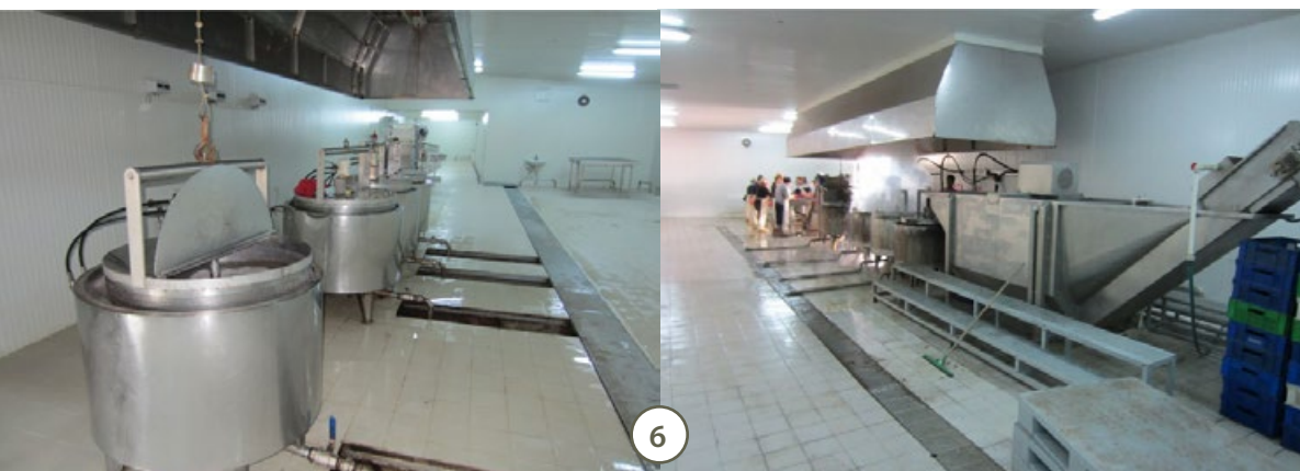
Figure 6. Pressurized boiling of sea cucumbers.