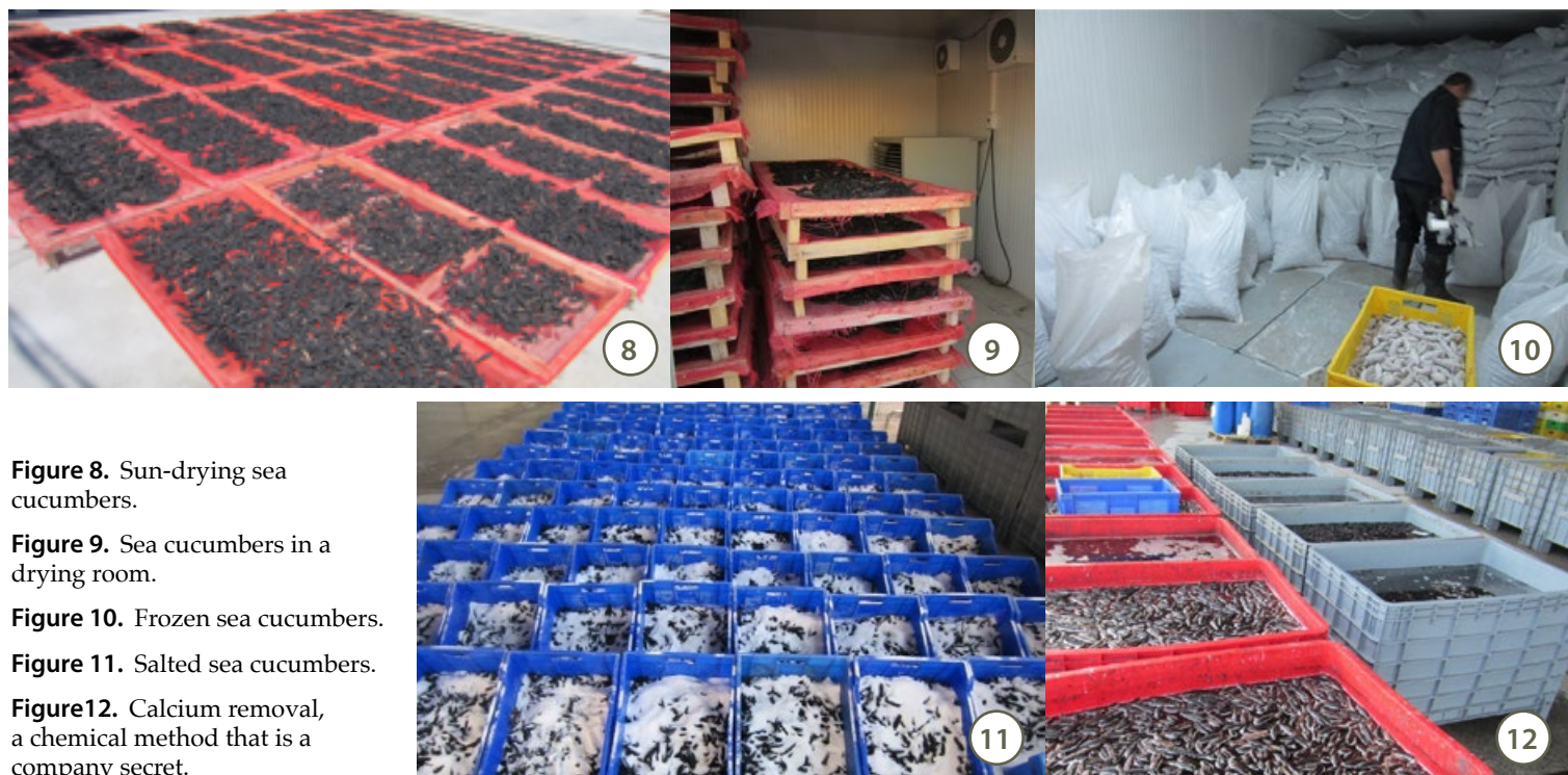
Figure 8. Sun-drying sea cucumbers.