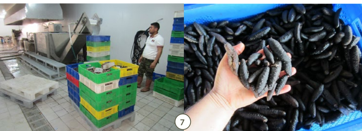
Figure 7. Boiled and cold-washed sea cucumbers.