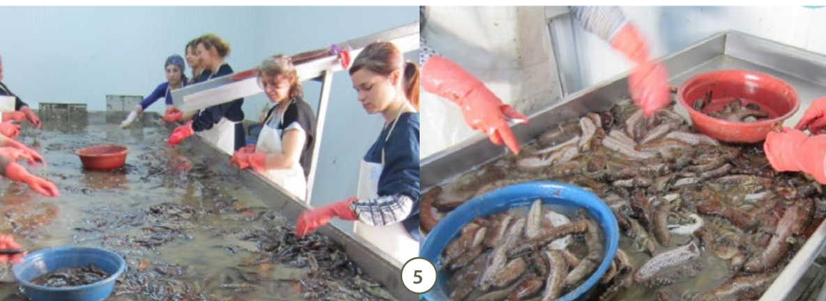
Figure 5. Evisceration of sea cucumber at the processing plant.

There was a gradual linear increase in sea cucumber production up to 2010, and in 2011 production