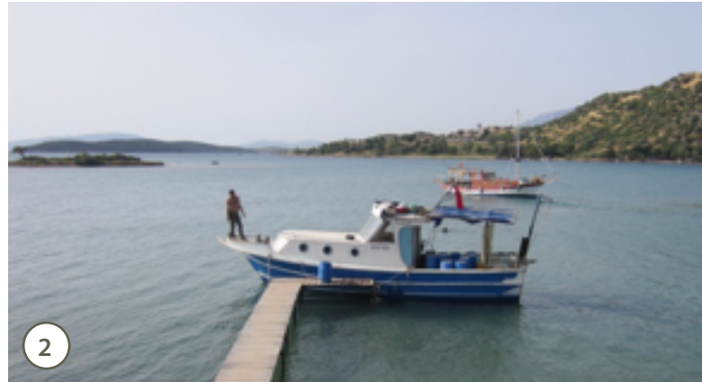
Figure 2. A sea cucumber fishing boat from İzmir.

Wooden boats, 4–12 m long and with 28–170 hp engines are typical in the sea cucumber fisheries of the region (Fig. 2). On average, two divers work on each vessel, diving to depths of 3–30 m using a hookah system (surface supplied air). In 2008, a single diver’s catch was anywhere from 2,000 to 3,000 individuals per day (Aydın 2008), a figure that is comparable to today’s catch amounts.