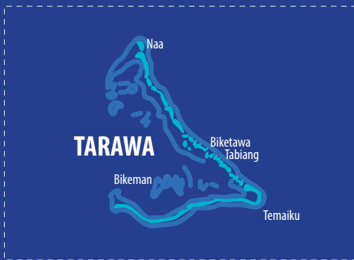
Map is not to scale