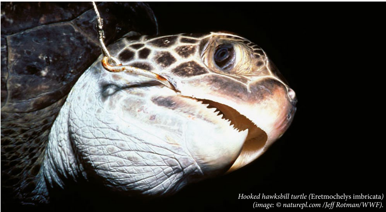
Hooked hawksbill turtle ( Eretmochelys imbricata ) (image: © naturepl.com /Jeff Rotman/WWF).

Six of the seven species of sea turtles found worldwide are considered to be threatened with extinction according to the International Union for Conservation of Nature red list criteria, with interactions with fishing gear posing a serious threat to their populations. The Western and Central Pacific Fisheries Commission (WCPFC) and the Pacific Community (SPC) are coordinating a joint-analysis by their members of sea turtle bycatch mitigation data from Pacific longline fisheries. The study is supported by funding from the Areas Beyond National Jurisdiction Tuna Project, a Global Environment Facility-funded and Food and Agriculture Organization of the United Nations-implemented programme of work designed to encourage and reinforce sustainable tuna fisheries.