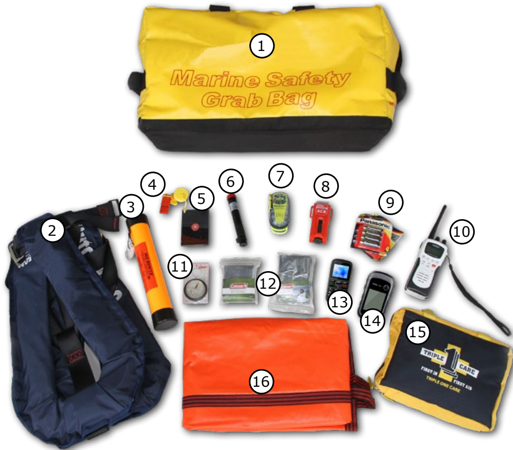
Figure 1. The safety grab bag and its contents (images: Jipé Le-Bars, SPC).

how to use and maintain the grab bag contents. Since its introduction, grab bags have played a role in at least four known successful rescues of small vessels. Given the notable success of the grab bag programme in Tuvalu, this article outlines a cost–benefit analysis (CBA) of the grab bag programme, which was undertaken for this country, in order to highlight the benefits arising from the positive commitment that Tuvalu has shown, and to provide a case for greater investment by the governments of other PICTs. By doing so, the CBA also provides supporting evidence for greater awareness and prioritisation of the safety of SSFs and small vessel operators across the Pacific Islands region.