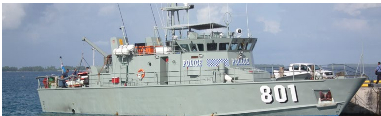
Figure 2. Tuvalu Pacific Patrol boat, Te Mataili.