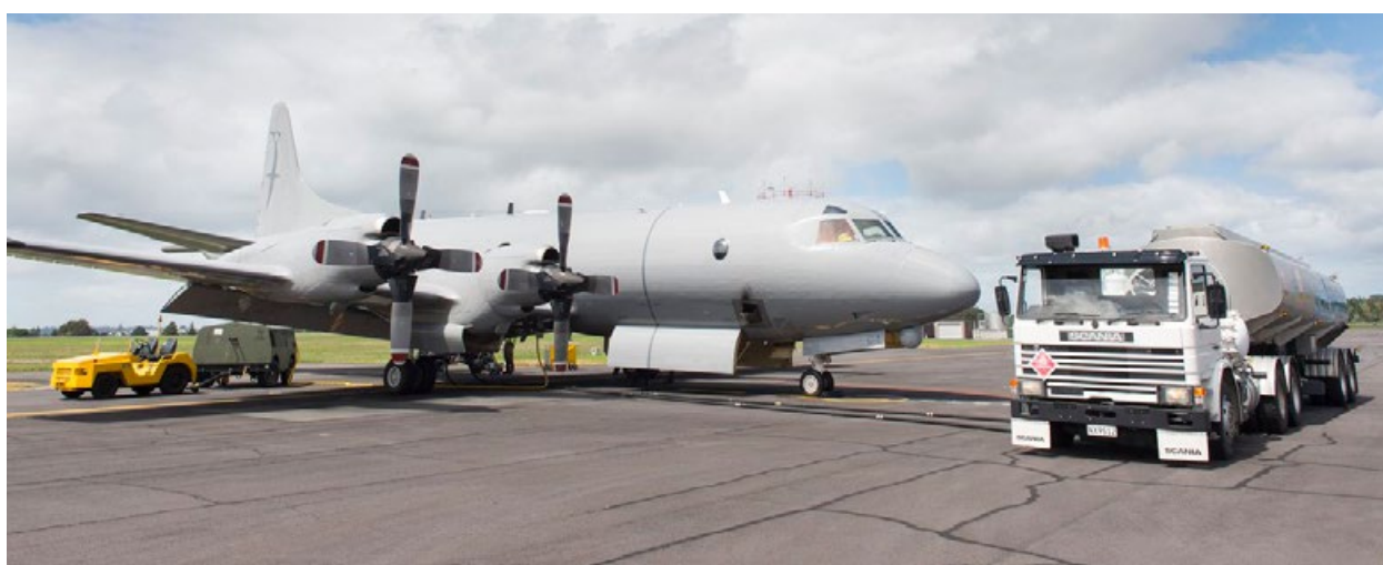
Figure 3. New Zealand Air Force P-3K2 Orion Aircraft.