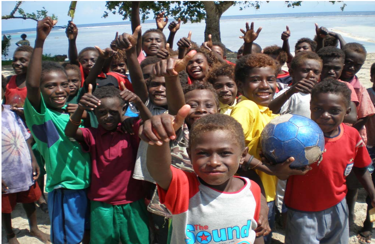
Students of Lontis Elementary School in the Autonomous Region of Bougainville..