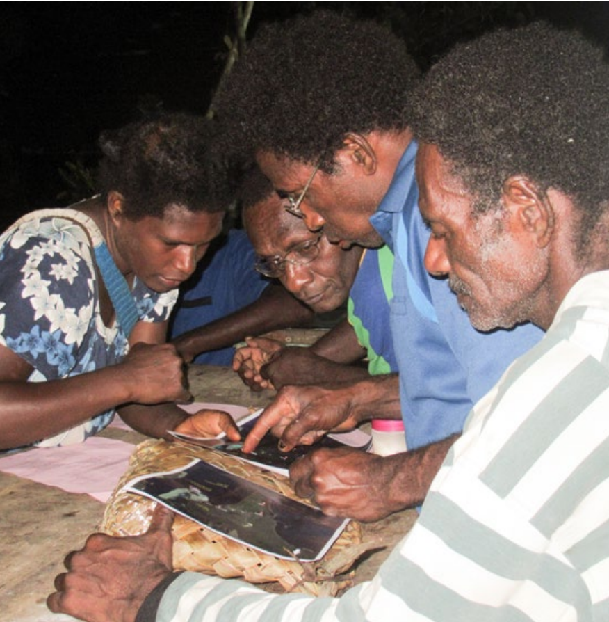
Figure 2. Salapiu community and clan leaders confirming area of management under Step 3 of the conservation deed process.

community in order to establish a conservation deed for marine spatial management. Once signed, a conservation deed is effective for five to seven years, following which it can be renewed, allowing community members to take the lead in managing their marine resources (Fig. 2).