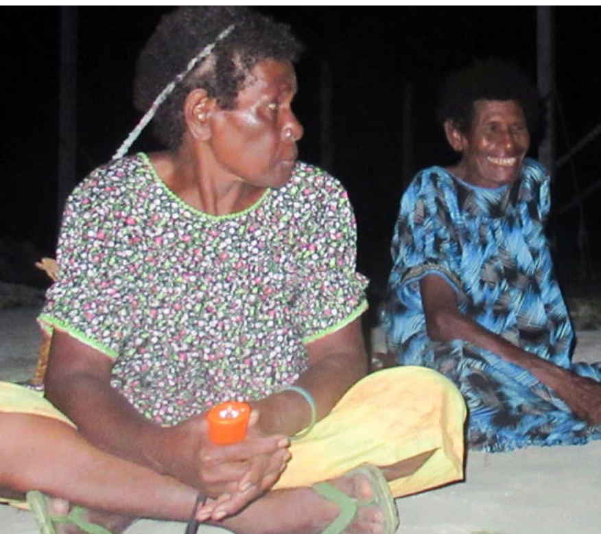
Figure 3. Women sitting away from the main meeting area at Bangatan during Step 3 of the conservation deed discussion.

WCS is currently working with communities to assist with strengthening the enforcement of LMMAs with conservation deeds. However, there have been many challenges during the initial steps of the conservation deed process, especially for women, who are the traditional land and coastal resource owners in New Ireland Province. For instance, we noticed that many women are illiterate, which hinders their ability to engage in the conservation deed process, yet when women are isolated from the men, they are often more vocal (Fig. 3). Other challenges include ensuring that residents understand the conservation deed process, including the potential advantages and disadvantages that may arise if a conservation deed is implemented, and conveying this information in the local language. The lack of communication between community members also caused some confusion regarding the purpose of the conservation deeds, which could delay the steps of the conservation deed process. Also, the lack of participation from some women, youths and elders resulted in the absence of certain sections of the society when information was disseminated or when decisions were made.