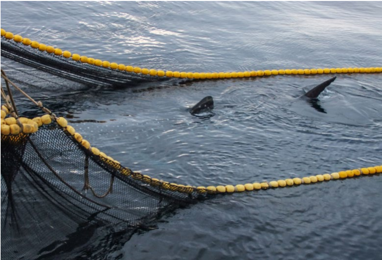
A whale shark ( Rhincodon typus ) stranded in a closed purse seine (image: L. Escalle, ©Orthongel-IRD, 2014).

Indian Oceans, to precisely assess whale shark post-release survival rates in tuna purse seine fisheries and to develop, if needed, management measures to limit fishery impact on whale shark populations.