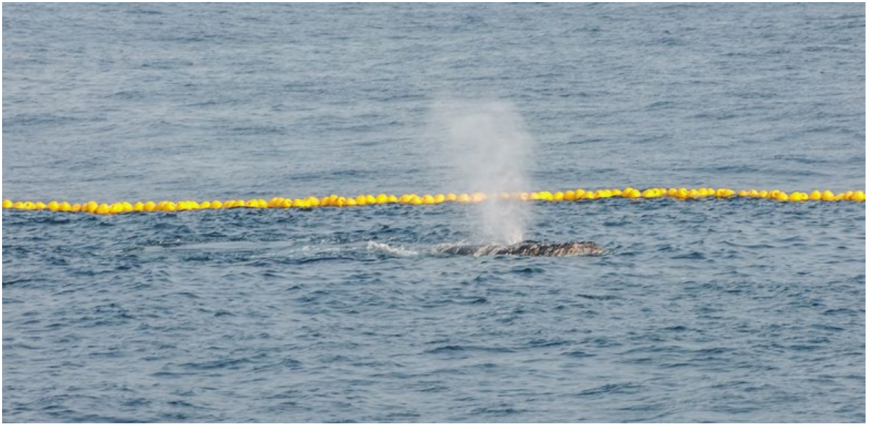
Humpback whale ( Megaptera novaeangliae ) encircled in a purse seine.