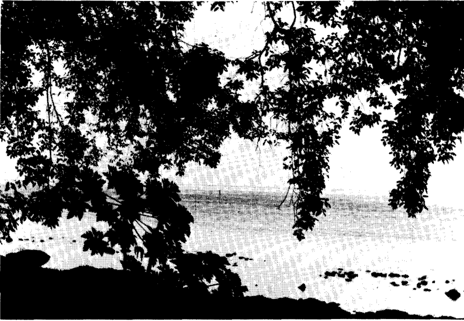
View to the lagoon, Huahine, French Polynesia.

continued lava flow, the ultimate result would be a broad "table reef" with no material of volcanic origin above the ocean surface.