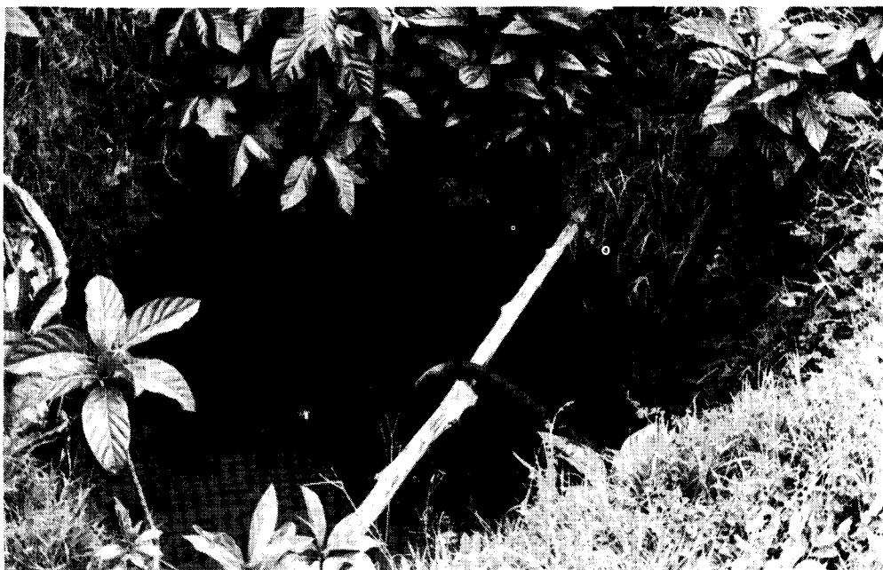
Fresh water is often scarce on atolls.

and the cisterns are covered to discourage mosquitoes. For direct human purposes, this technique is more widely practised on atolls than any other.