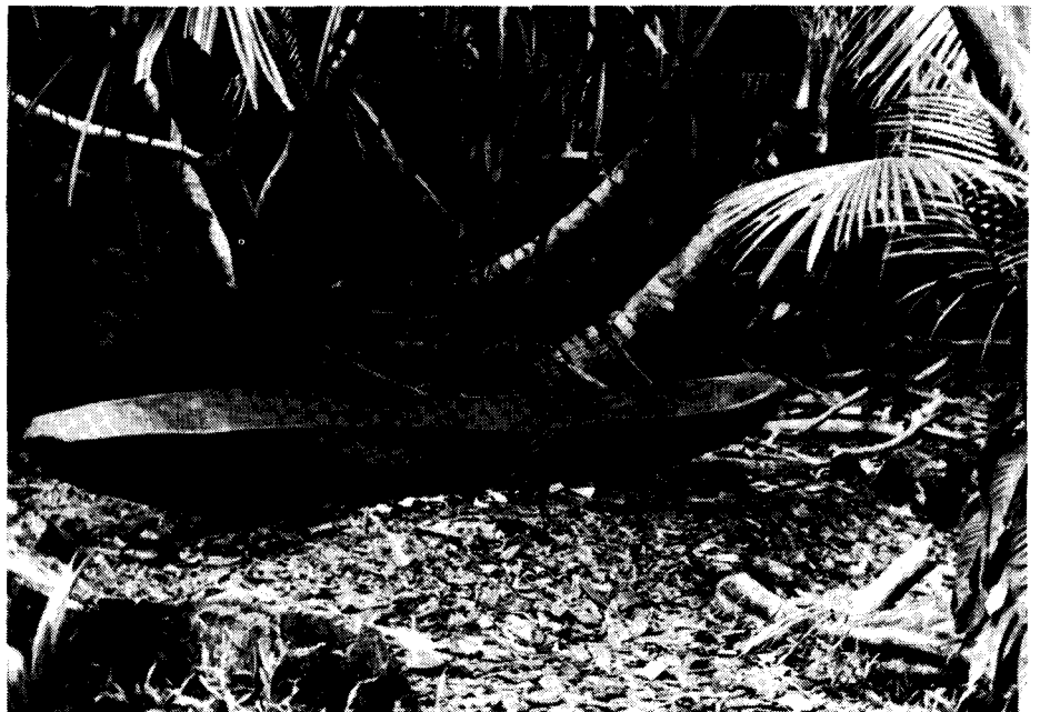
Making a canoe in Majuro, Marshall Islands.

Since our interest here is with cultivation on islets, it is important to emphasize that there are six means by which materials can arrive on a reef in such a way as to be found above the high tide level: