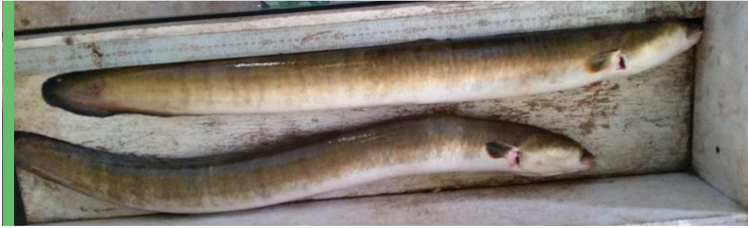
Two 100 cm, 500 g specimens of Pacific shortfin eel Anguilla obscura caught in Tailevu Province, Fiji Islands (T Pickering photo).