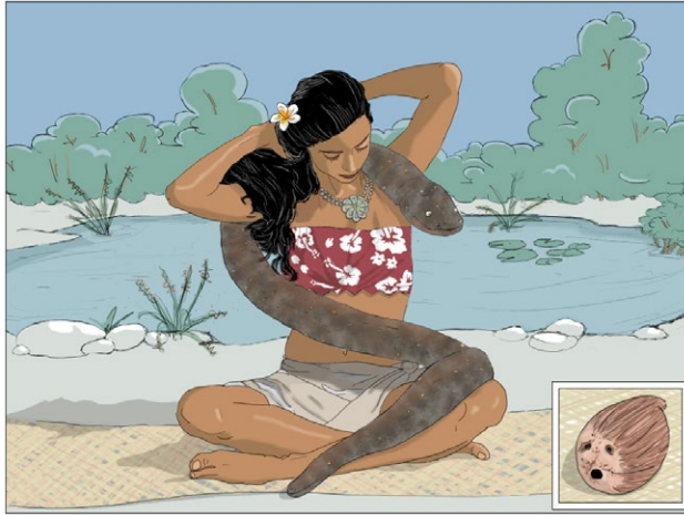
Left: A giant marbled eel Anguilla marmorata on sale in Suva Market, Fiji Islands.