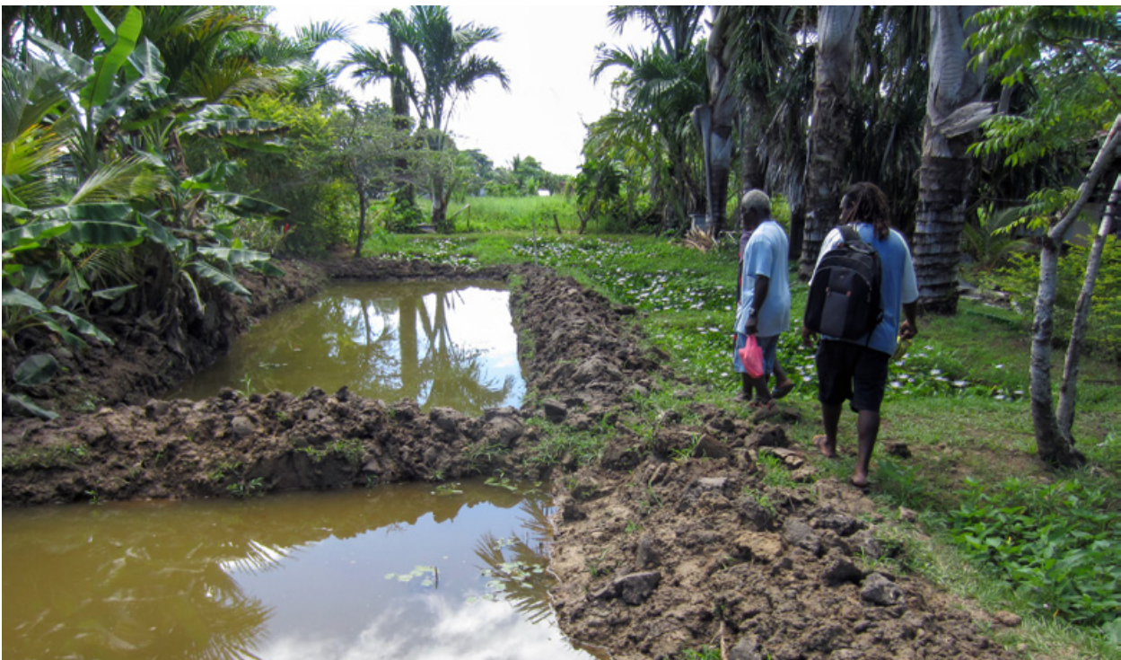
Tilapia farm ponds in Solomon Islands.

I would like to point out that as an MFMR Policy Officer and PIFP, I am very proud of the efforts made by the Solomon Islands Government and MFMR to highlight the importance of aquaculture in national key policy documents. I am also very proud to be part of a team at SPC that works hand-in-hand with MFMR towards the vision of a healthy aquaculture sector that improves the social and economic livelihoods of all Solomon Islanders.