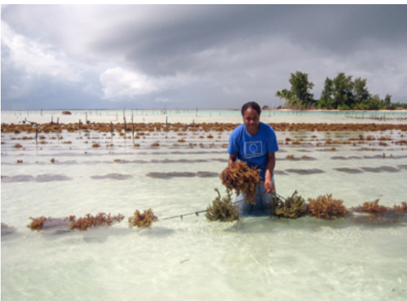
Seaweed farming in Solomon Islands