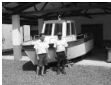
Well known FV Etelis will once again play a key training role on the SPC/Nelson course