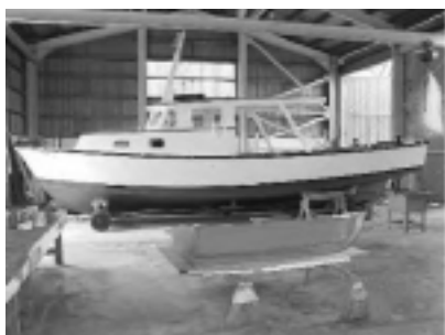
Training vessel Emm Nao will be used to demonstrate small-scale fishing operations

As part of the new course, trainees will also be required to process catches to export standards and marketing trials will take place. Those readers with a good memory and who are concerned trainees, will recall that the then Vanuatu Fisheries Training Centre previously hosted the SPC/Nelson course's practical fishing module in 1992 and 1993. Let's hope that the 2006 catches will be as memorable as those back then!