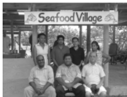
Six participants attended the workshop.

PIMRIS is a joint project of four international organisations concerned with fisheries and marine resource development in the Pacific Islands region. The project is executed by the Secretariat of the Pacific Community (SPC), the South Pacific Forum Fisheries Agency (FFA), the University of the South Pacific's Pacific Information Centre (USP-PIC), and the South Pacific Applied Geoscience Commission (SOPAC). This bulletin is produced by SPC as part of its commitment to PIMRIS. The aim of PIMRIS is to improve the availability