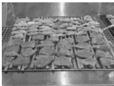
The workshop included a practical component on product development