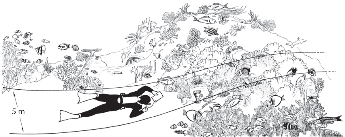
A fisheries scientist swimming along a transect and counting the numbers of different species within a 5 m wide band over a coral reef. From: King M. 2007. Fisheries biology, assessment and management. UK, Oxford: Wiley-Blackwell. 400 p.

To assess something is to examine its status or standing at a given time. In fisheries assessment we are gathering information on the status or health of a fish stock or fishery.* This assessment is used to provide fisheries managers with information that they can use to manage a fish stock.