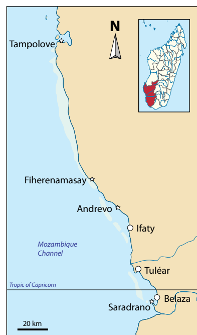
Figure 1. Southwestern Madagascar and the location of the four villages where intensive sea cucumber farming has been monitored since 2009.

Growth monitoring was conducted in four villages in southwestern Madagascar near Toliara from May 2009 to October 2010. One of the villages, Sarodrano, is situated south of Toliara and the three others (Andrevo, Fiherenamasay and Tampolove) are in the north (Fig. 1).