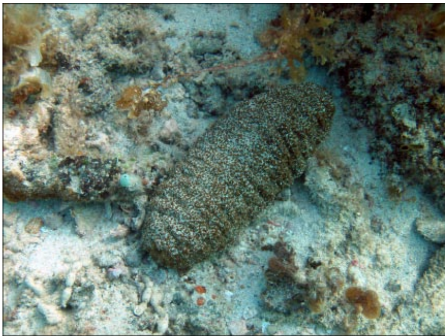
Figure 1. Actinopyga echinites .

Where X is the variance at the given block size, N is the total number of quadrats in a transect, x_1 is the number of individuals within the first quadrat in the transect, x_2 is the second and x_N is the last quadrat. Computations analogous to Eq. 3 are made at successively larger block sizes (Ludwig and Reynolds 1988). Calculations for the TTLQV were conducted using Microsoft Excel, although the use of Microsoft Visual Basic is recommended for longer transects of contiguous quadrats.